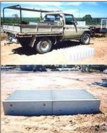
Easy to Install & maintain