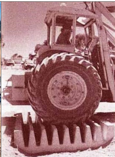
The grid can withstand a 14tonne load